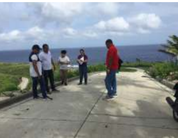
Conduct of evaluation.