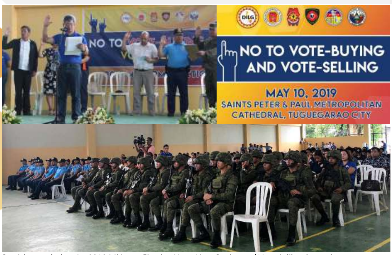
Participants during the 2019 Midterm Election No to Vote-Buying and Vote-Selling Campaign

Around 250 participants gathered at the Saints Peter and Paul Metropolitan Cathedral Covered Gym, Tuguegarao City, Cagayan on May 10, 2019 to affirm their strong support and commitment against vote-buying and vote-selling for the 2019 National and Local Elections also called Midterm Elections. The participants were composed of regional directors and heads of the Department of the Interior and Local Government (DILG), Philippine National Police (PNP), Bureau of Fire and Protection (BFP), Bureau of Jail Management and Penology