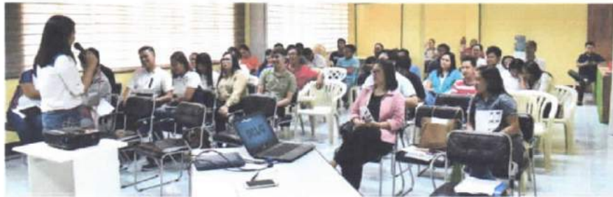
Orientation conducted on January 24, 2018 at DILG RO2 Conference hall