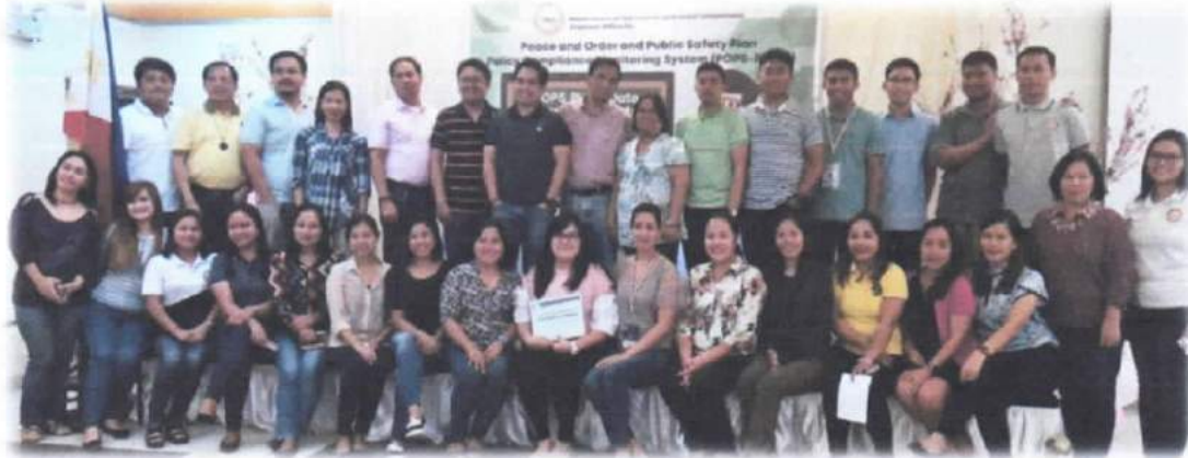
The Participants and the Facilitators with the Resource Person