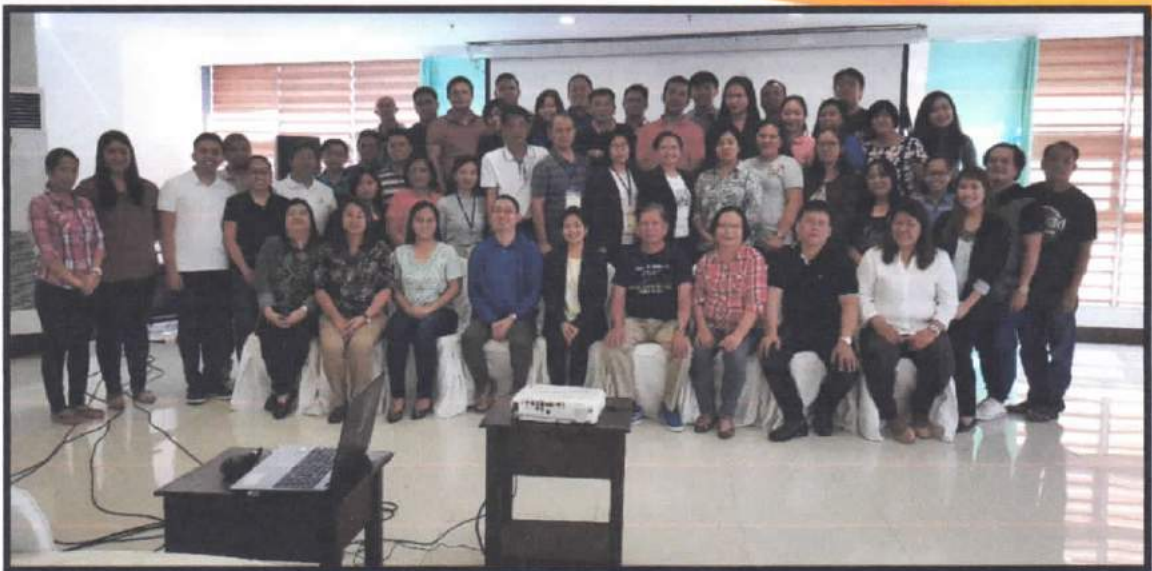
Participants and training management after the closing ceremony