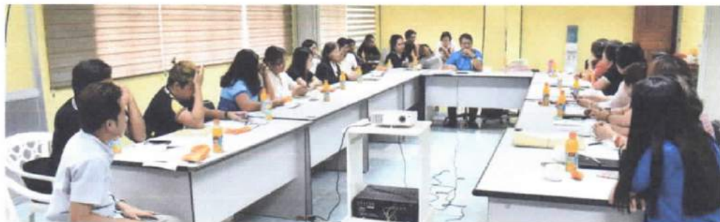
COA exit conference with the resident auditor and DILG RO2 team on Feb 27, 2018 at DILG RO2 conference hall.