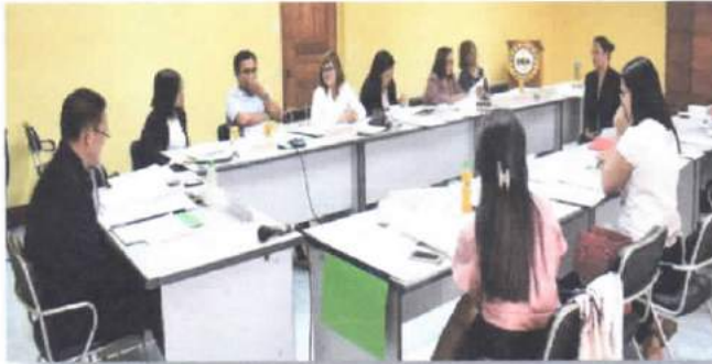
Applicants during the interview