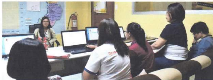
Interview with one of the applicants on Multi media coordinator