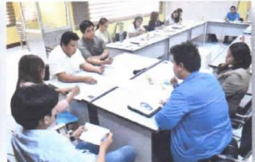
Applicants during the group dynamics

Out of the above-mentioned activity, the following were appointed/promoted: