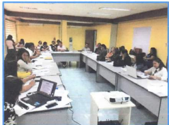
Follow-up Meeting with LRI Representatives relative to the Conduct of Sangguniang Kabataan (SK) Mandatory Training