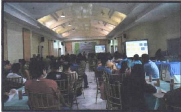
CMCI Survey Forum