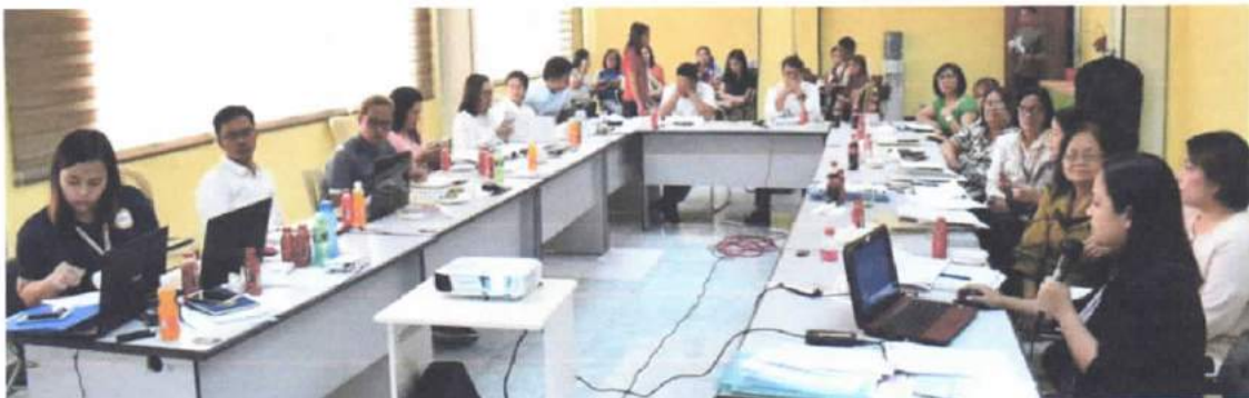
A Focus Group Discussion was also conducted on March 12-16, 2018 to incorporate all audit findings and management recommendations

It was followed by a Management Review conducted on January 23, 2018