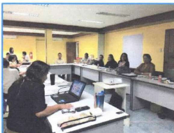
Regional and Provincial Management Team Meeting with the LRI Representatives