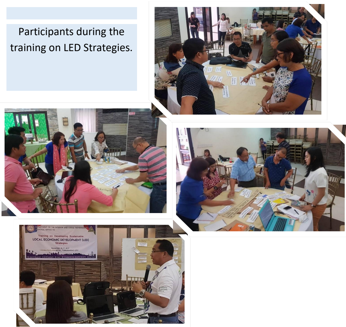
Participants during the training on LED Strategies.

The activity aimed to provide the participants with the knowledge and skills necessary in crafting strategies for local economic development.