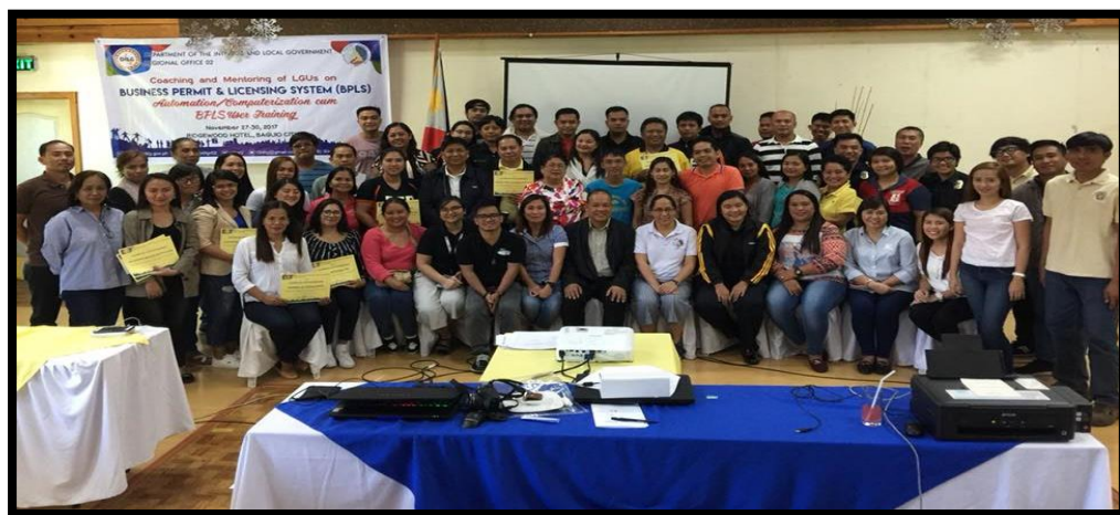
Participants from DILG R02 and DILG CAR