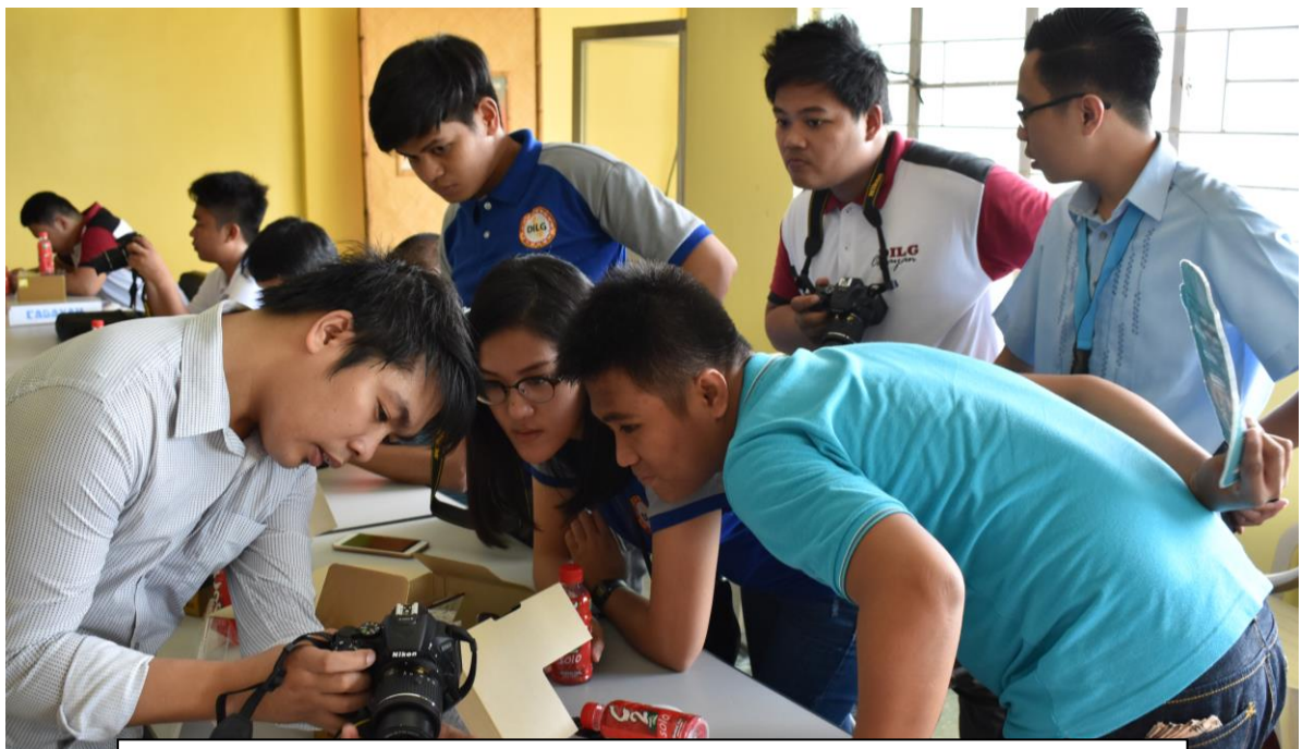
Participants during the ICT Capacity for Enhanced Productivity held at DILG Conference Hall last 21-29 November 2017.