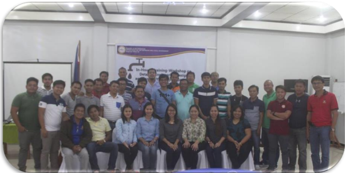
Participants from the Municipalities of Nagtipunan, Maddela and Saguday, Quirino; Quezon and San Mateo, Isabela; Alcala, Allacapan and Rizal, Cagayan during the Training-Workshop on DED and FS preparation.